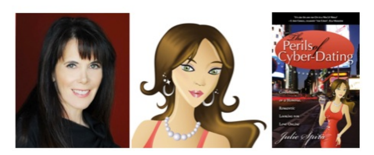
Praise for The Perils of Cyber-Dating